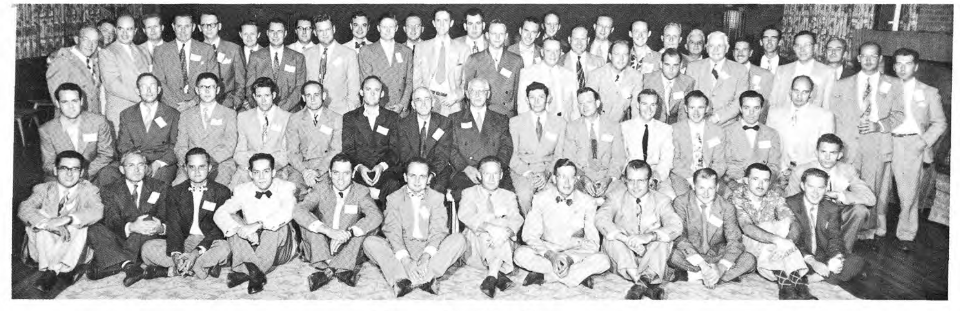
The Early Years